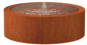
WATER TABLE ROUND CORTEN