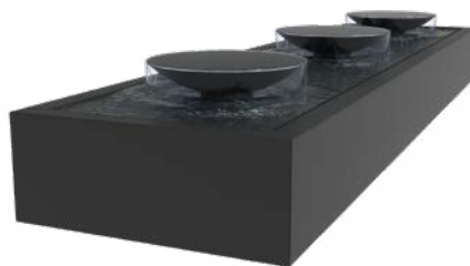
WATER TABLE WITH BOWLS ALUMINUM