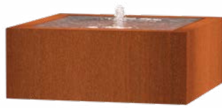
WATER TABLE SQUARE CORTEN