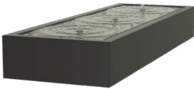
WATER TABLE ALUMINUM