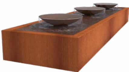
WATER TABLE WITH BOWLS CORTEN