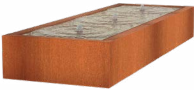
WATER TABLE CORTEN

For a complete overview of all our products and specifications, please visit www.adezz.com