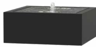
WATER TABLE SQUARE ALUMINUM