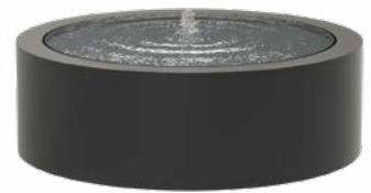
WATER TABLE ROUND ALUMINUM