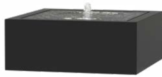
WATER TABLE SQUARE ALUMINUM