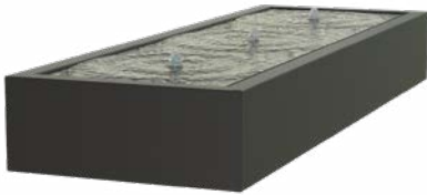
WATER TABLE ALUMINUM