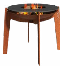
COSA + BAKING TRAY