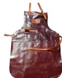
FORNO LEATHER APRON