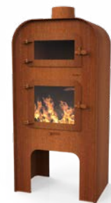
GAP + PIZZA