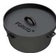
FORNO CAST IRON PAN