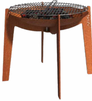
COSA + GRILL