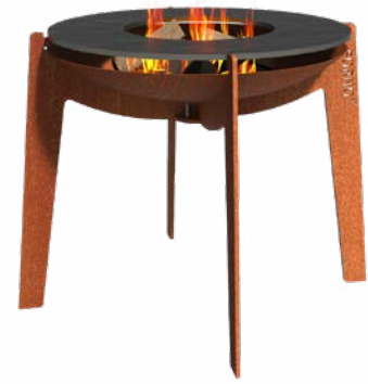
COSA + BAKING TRAY