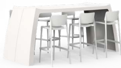
ORIGINAL HIGH TABLE