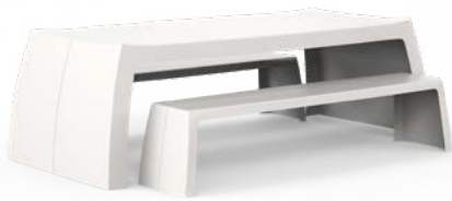
ORIGINAL TABLE AND BENCH

For a complete overview of all our products and specifications, please visit www.onetosit.com .