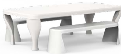
BAROK TABLE AND BENCH