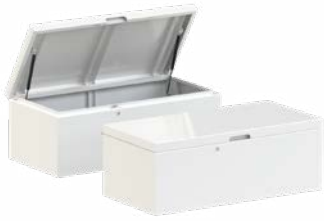
GARDEN BOX STB120

For a complete overview of all our products and specifications, please visit www.onetosit.com .