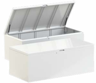
GARDEN BOX STB200