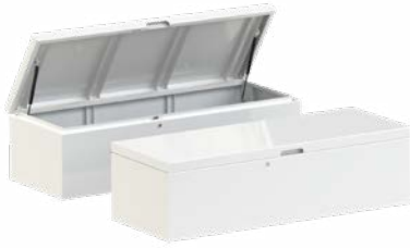
GARDEN BOX STB160