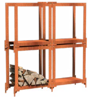
BUNKE WOOD STORAGE