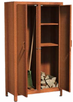
WOOD STORAGE LOCKABLE