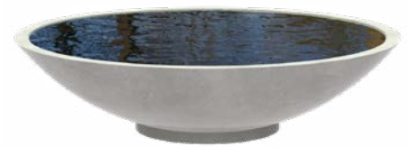
WATER BOWL POLYMER CONCRETE