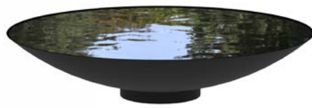
WATER BOWL COATING DB703