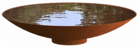
WATER BOWL CORTEN

For a complete overview of all our products and specifications, please visit www.adezz.com