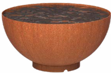
WATER BOWL BOCCA