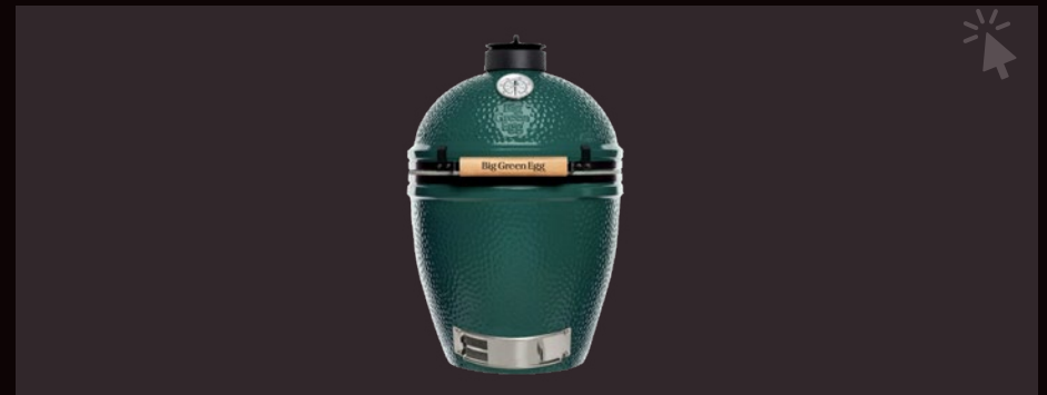
BIG GREEN EGG LARGE