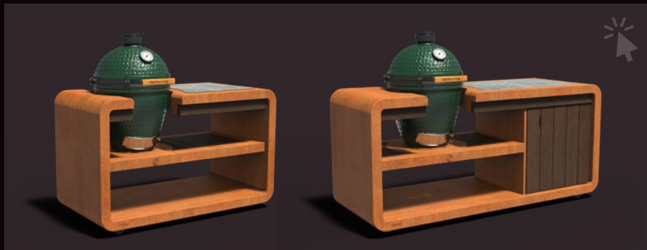
KAMADO STATION 1500 & 2000 CORTEN STEEL