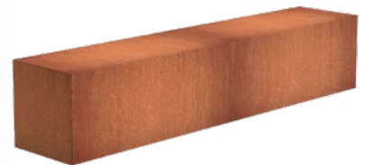
PEDESTAL RECTANGLE LOW CORTEN