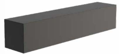
PEDESTAL RECTANGLE LOW ALUMINUM