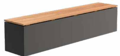
PEDESTAL ALUMINUM WITH SEAT