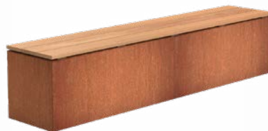
PEDESTAL CORTEN WITH SEAT