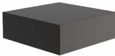
PEDESTAL SQUARE LOW ALUMINUM