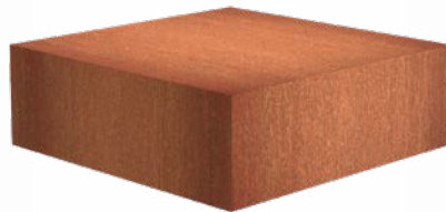
PEDESTAL SQUARE LOW CORTEN