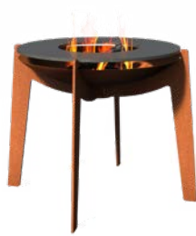
COsa + BAKING TRAY