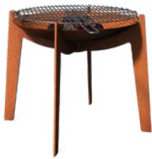
COsa + GRILL