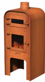
GAP + PIZZA