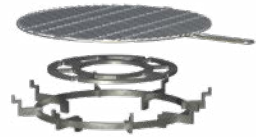
FORNO BULL BTC 1A