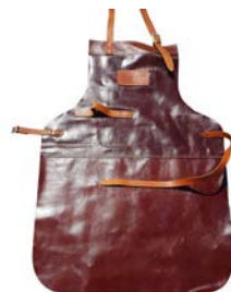
FORNO LEATHER APRON