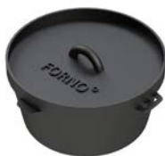
FORNO CAST IRON PAN