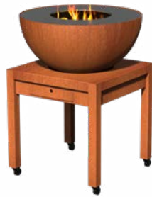
FORNO BULL BTC 1