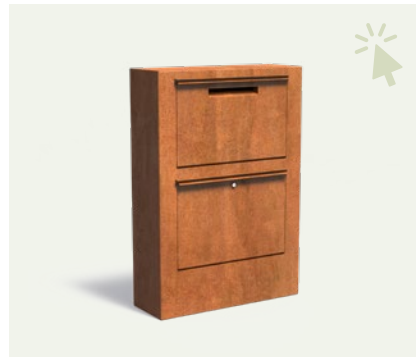
PACA CORTEN STEEL