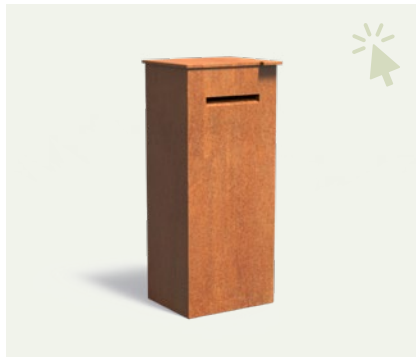
CASE CORTEN STEEL

We have various models and materials of parcel post boxes. Our range of parcel post boxes is shown below.