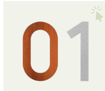
HOUSE NUMBERS | CORTEN STEEL - STAINLESS STEEL