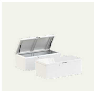
GARDEN BOX STB120

For a complete overview of all our products and specifications, please visit www.adezz.com