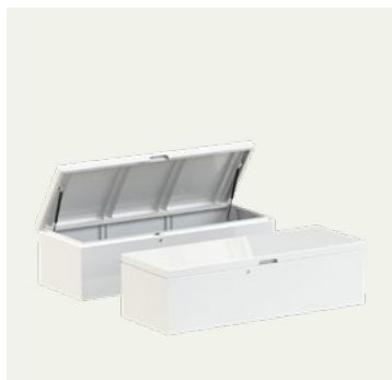
GARDEN BOX STB160