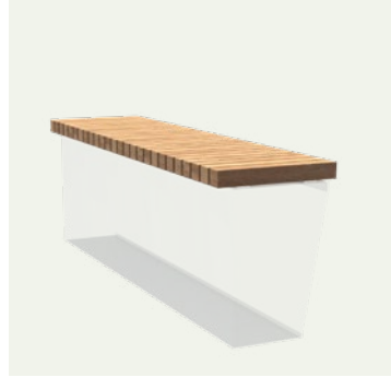
SEATING IN WITDH