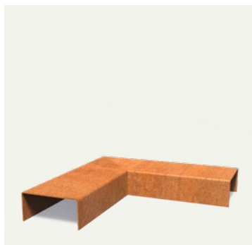
U-PROFILE CORNER PIECE